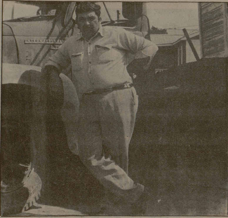
Battalion photo by Frank K. Vasovski

The larger the house, the smaller the radius of the authorization. Major highways can be used only for access to a secondary road and on a distance less than one mile.