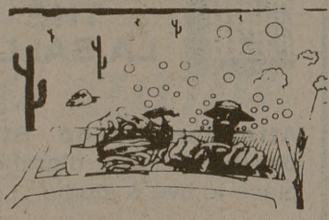
First in a Series