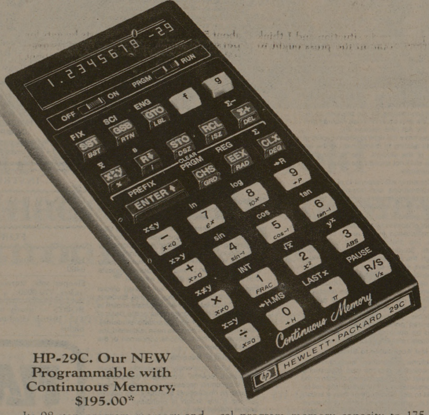
HP-29C. Our NEW Programmable with Continuous Memory. $195.00* Its 98-step program memory and 16 of its 30 storage registers stay "on" even when the calculator is "off," so you can store programs and data for as long as you wish. Continuous Memory plus fully merged keycodes bring typical

They're proven performers. In space. On Everest. In the labs of Nobel laureates. Since we built the first, back in 1972, our advanced calculators have been tested by millions worldwide, and they've passed. They have staying power. Today's classroom problems quickly grow into tomorrow's on-the-job problems. HP calculators are designed and built to handle both. They're investments in a future that happens fast. They're straightforward. "Advanced" doesn't mean "complicated." It means "uncomplicated." HP calculators are, above all, straightforward. They're easy to use. HP calculators not only grow with you; they grow on you. They feel natural, comfortable, because we designed them to work like you think. They're efficient. HP calculators take the direct approach. All feature RPN, a time-saving, parenthesis-free logic system. All programmables feature a memory-saving keycode merging capability. They're personal. Professionals design their own ways to solve their particular problems, and they expect their calculators to be versatile enough to accommodate them. Ours are. There's a variety. To say we offer a full line is an understatement. We offer a choice. That's why we publish a unique "Selection Guide" that spells out the capabilities of each. Your HP dealer has your free copy. (800) 648-4711. The number to call for more information and your HP dealer's name and address (unless you're in Nevada, in which case you can call 323-2704).