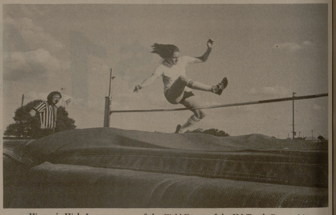
Women's High Jump was one of the Field Events of the IM Track Competition.

Entries opened Monday, April 18th and close Tuesday, April 26th, for the Annual Cross Country Race. The Cross Country Event is open to all Texas A&M Students, Faculty, and Staff. The contest will be held Wednesday, April 27th, at 5:30 p.m. There will be four divisions, consisting of men singles, women singles, men's team, and women's team. A team consists of a maximum of five persons, with the first three finishers scoring points for their team. The race will be held over a 2.5 mile stretch, located on the front section of the campus, adjacent to Highway 6 and University Drive. If you intend to represent a team, don't forget to include the name of your team on the entry blank. Winners from each respective division will be awarded certificates. Entry blanks are available in the