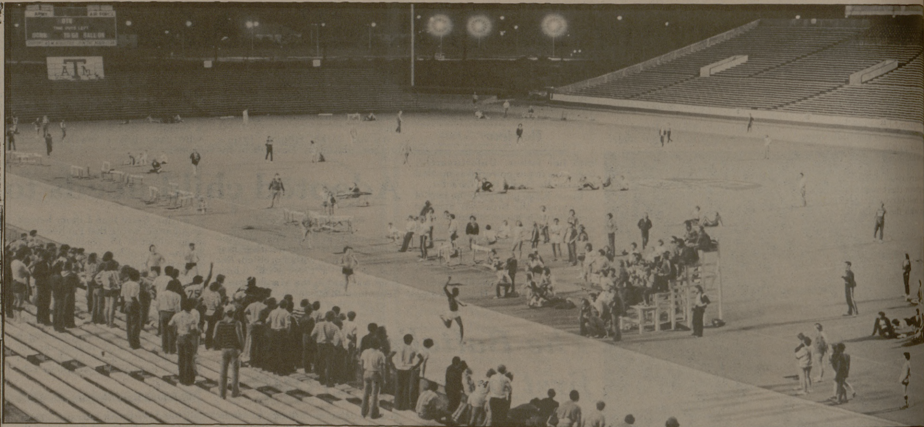
In the twilight, the men's and women's Intramural Track finals were held. A crowd of 300 watched, as participants from dorms and apartment complexes competed in 14 events.