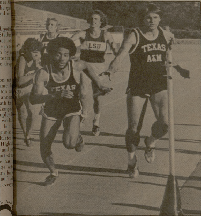
Battalion staff photo