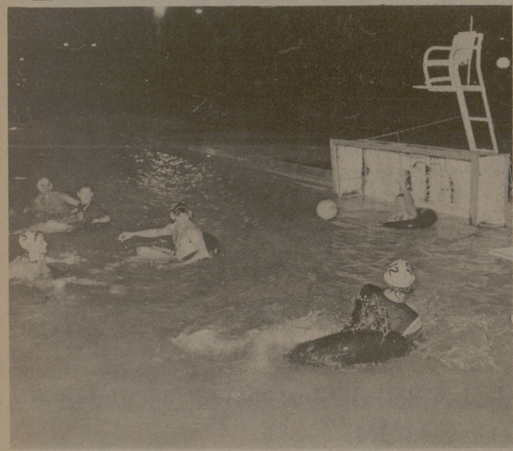
IM Bridge (above) and Inner Tube Water Polo are taking place now. Bridge is played at the Golf Clubhouse while Innertube as well as conventional Water Polo are played at both the outdoor and indoor pools.