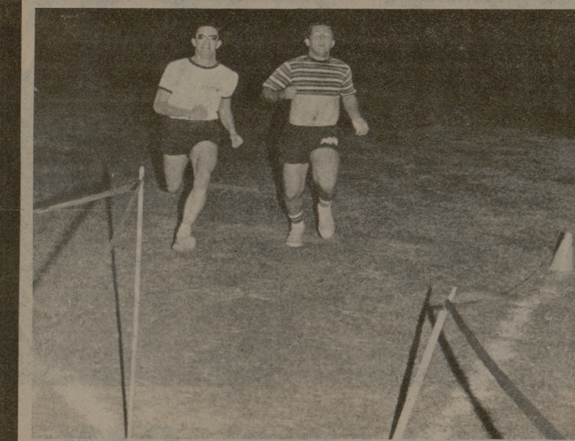
Above — Members of the Corps are shown in a dead heat at the finish of the Cross-Country Race... See the story at right.