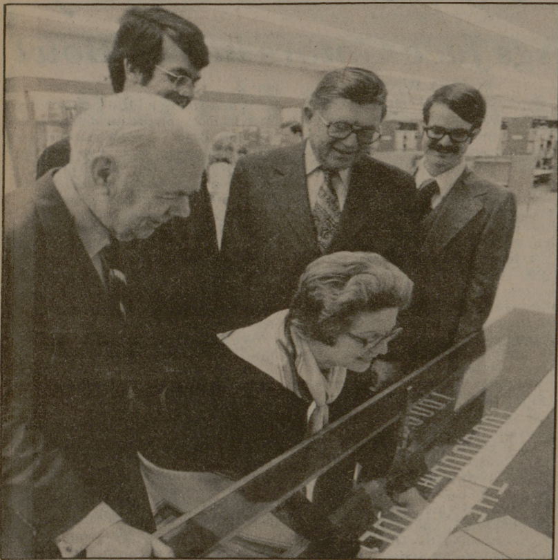
Millionth book for library