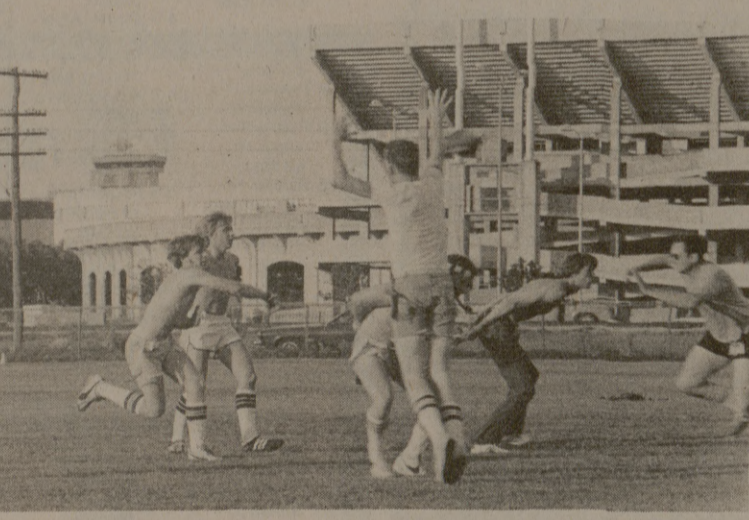
New rules for Flag Football this year include the requirement that all offensive linemen keep their hands behind their backs (as shown). This new rule is designed to help prevent injuries.