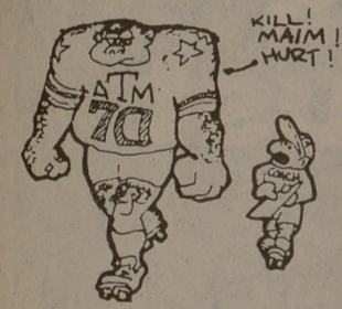
The football team shops at University Book Store...