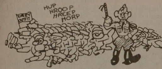
The Corps of Cadets Shop at University Bookstore...