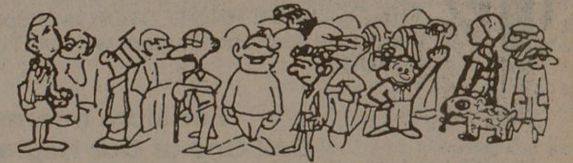
Day Students Shop at University Book Store...

NEW AND USED BOOKS GIFTS • MILITARY SUPPLIES CALCULATORS • ENGINEERING AND ARCHITECTURE SUPPLIES DESIGN YOUR OWN T-SHIRTS