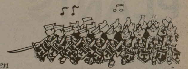
The Band shops at University Book Store...

One set of Freshman Textbooks Will Be Given Away to Some Lucky Freshman August 29 3:00 P.M.