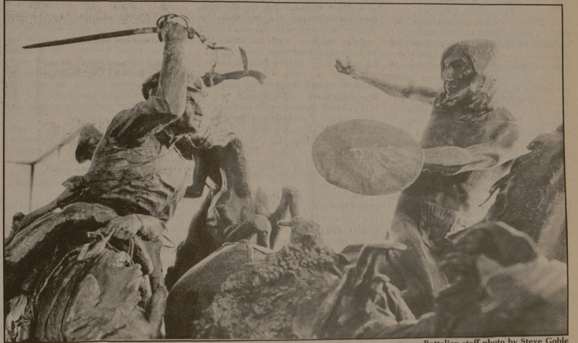
Battalion staff photo by Steve Goble

Security personnel counted 106 persons scanning and studying the famous paintings and bronzes Sunday after they were installed.