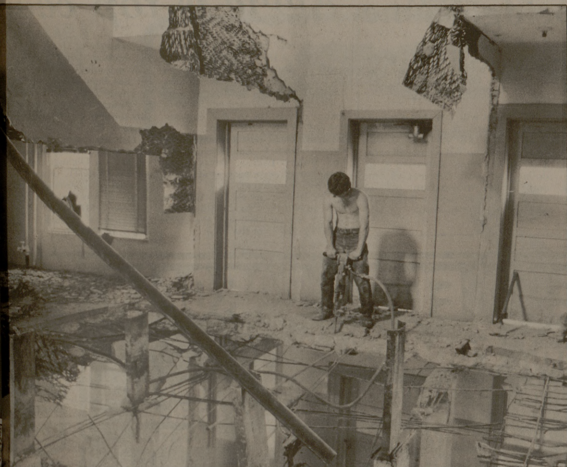
A man with a jackhammer (above) can be very effective in tearing up floors. Holes are being made through parts of Milner's floors to make way for an elevator shaft. The floors (below) will be modeled into classrooms and/or offices.