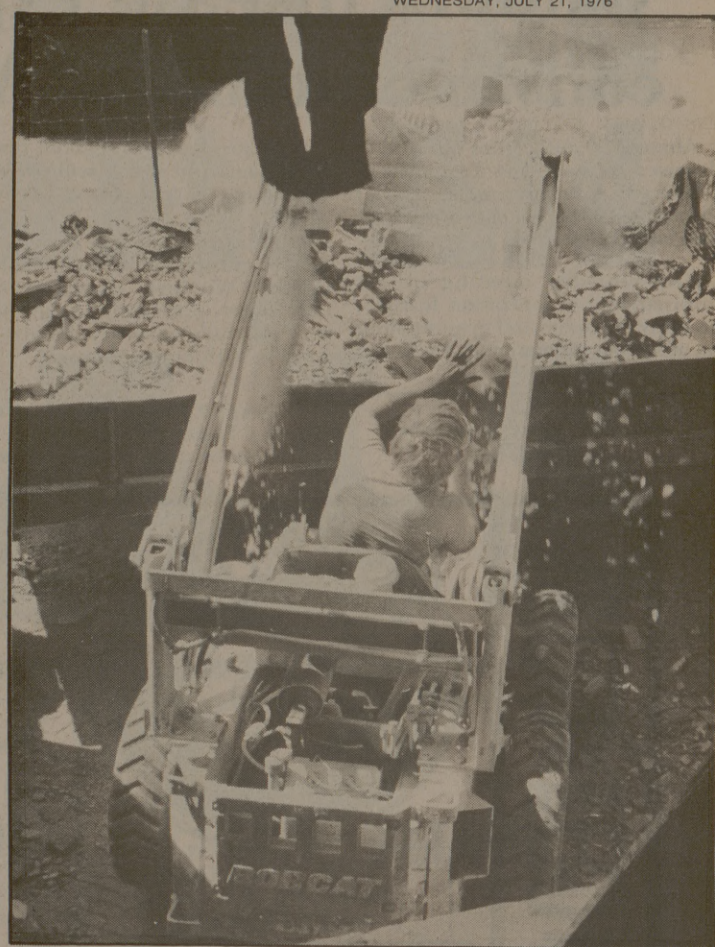
Most demolition jobs require lots of back-breaking, muscle-straining work. This man is one of the fortunate few; he gets to sit down while putting in his ten hours.