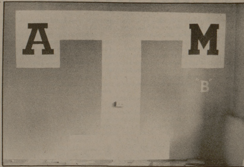
Much more than debris is being taken from Milner Hall. Remnants of many proud Aggies will be destroyed, such as this wall, painted by a past Milner resident. (above)