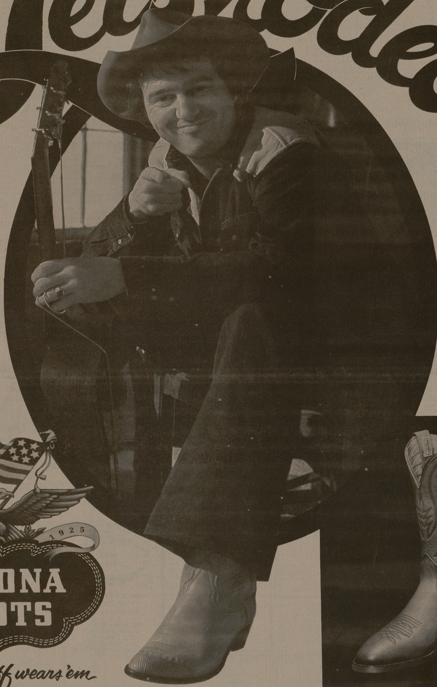
STYLE #5004. Sunrise Full-Grain Veal Vamp and 12" Top with deep scallop; No. 20 Toe; C Heel; Thin-Line Cushion Shank.