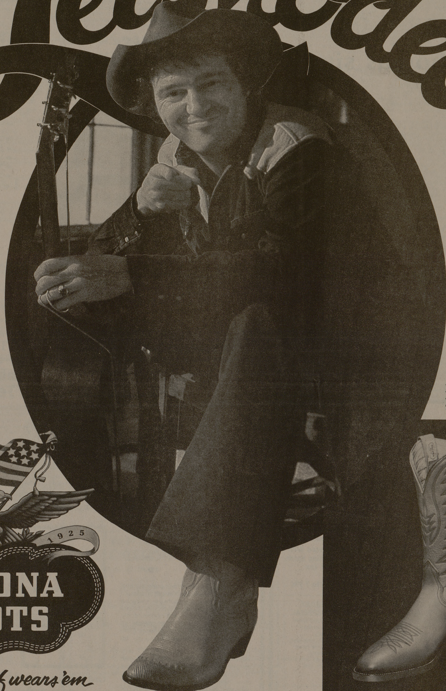
STYLE #5004. Sunrise Full-Grain Veal Vamp and 12" Top with deep scallop; No. 20 Toe; C Heel; Thin-Line Cushion Shank.