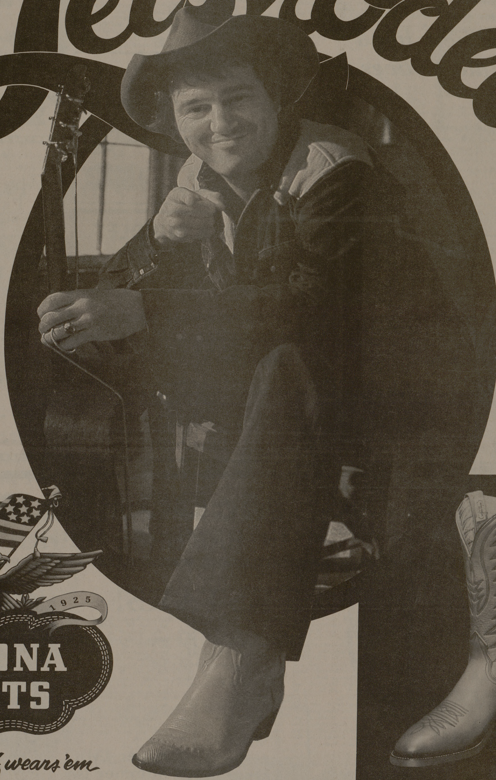
STYLE #5004. Sunrise Full-Grain Veal Vamp and 12" Top with deep scallop; No. 20 Toe; C Heel; Thin-Line Cushion Shank.