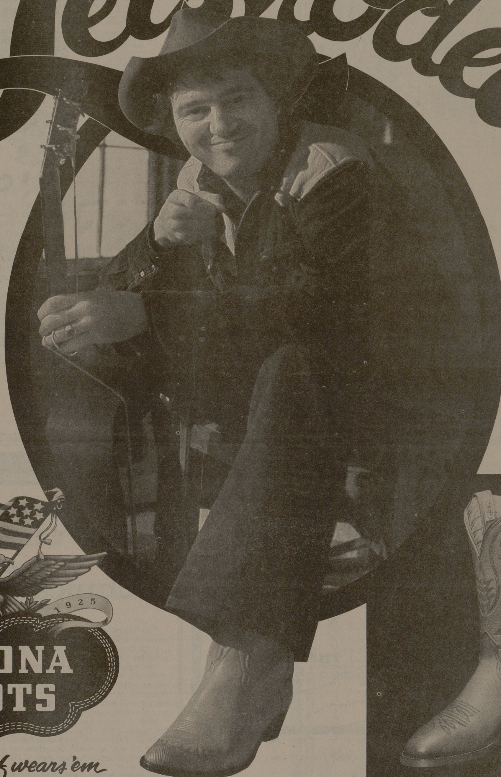
STYLE #5004. Sunrise Full-Grain Veal Vamp and 12" Top with deep scallop; No. 20 Toe; C Heel; Thin-Line Cushion Shank.