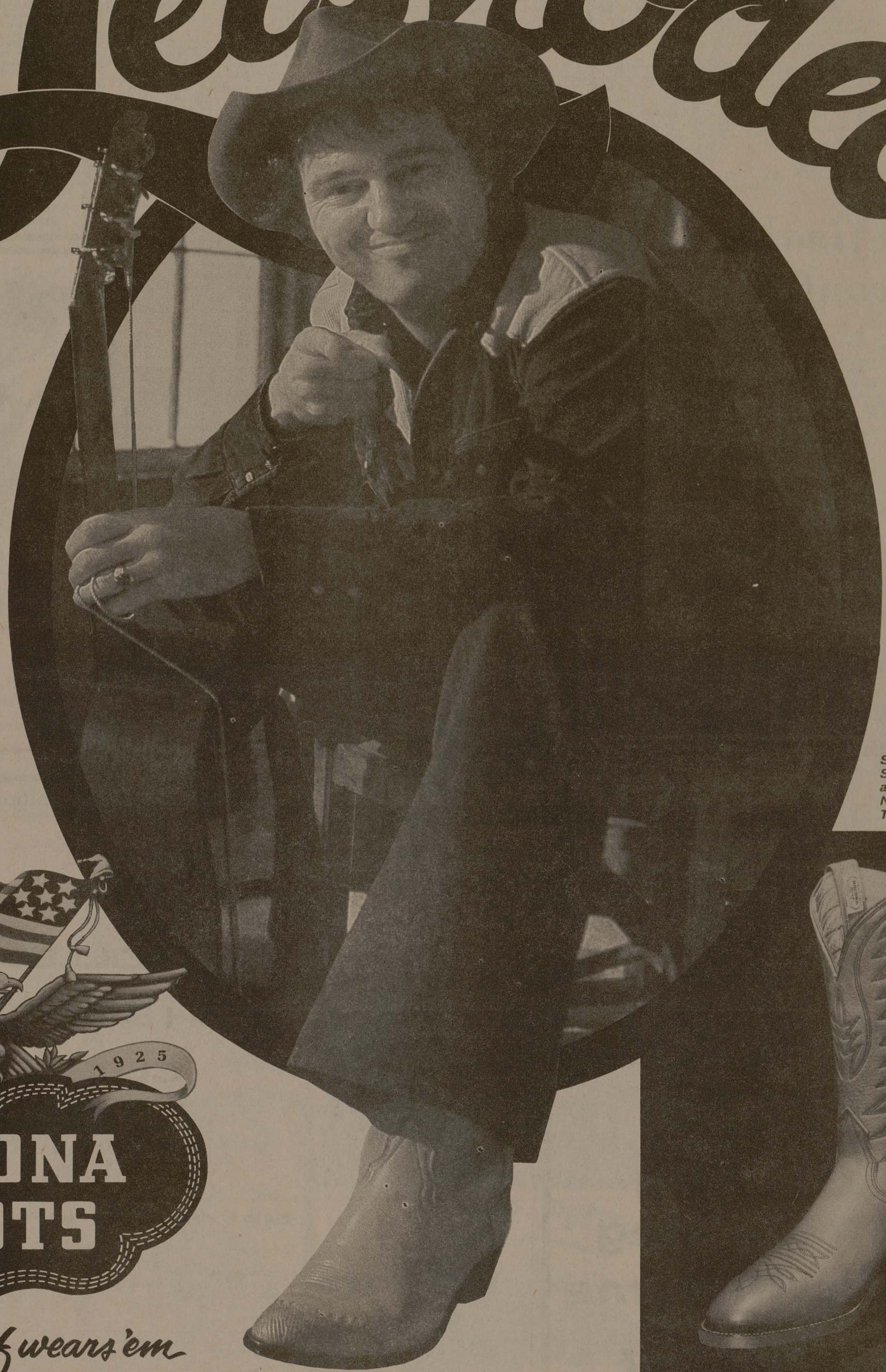
STYLE #5004. Sunrise Full-Grain Veal Vamp and 12" Top with deep scallop; No. 20 Toe; C Heel; Thin-Line Cushion Shank.