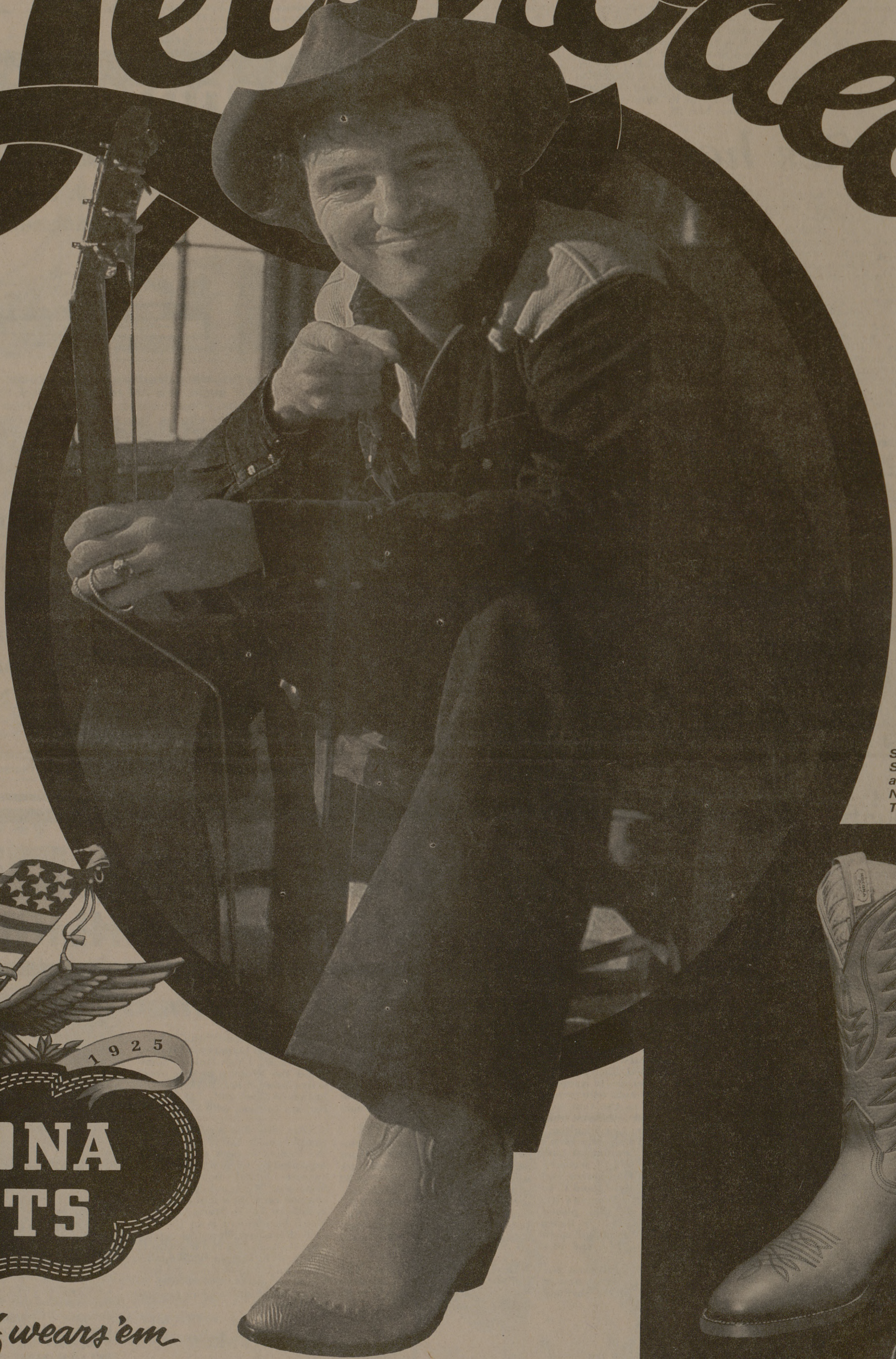
STYLE #5004. Sunrise Full-Grain Veal Vamp and 12" Top with deep scallop; No. 20 Toe; C Heel; Thin-Line Cushion Shank.