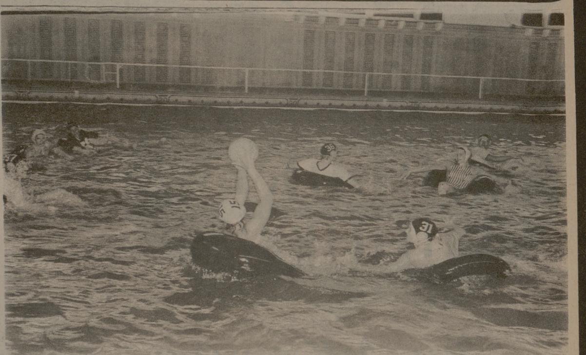
Co-Rec water polo using inner tubes is played in the Downs indoor pool.