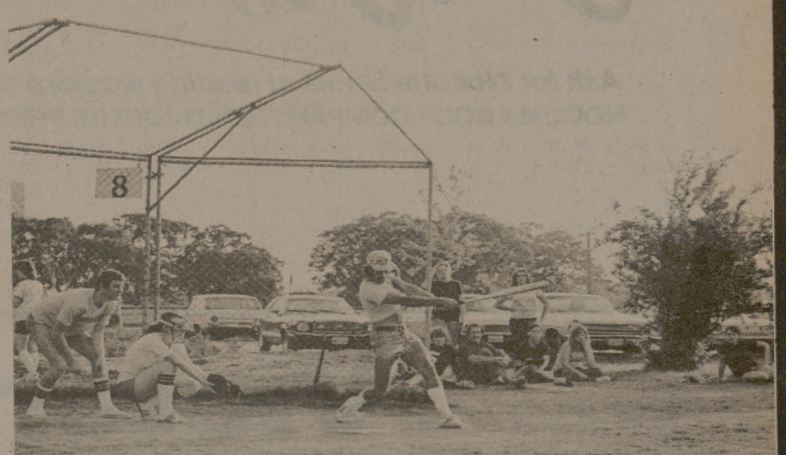
Co-Rec Softball action as the Batters take on the Pistoles in the closing weeks of this sport.

The divisional winners will go on to play each other at 5:00 p.m., Tuesday, April 27, to decide the Corps Champions.