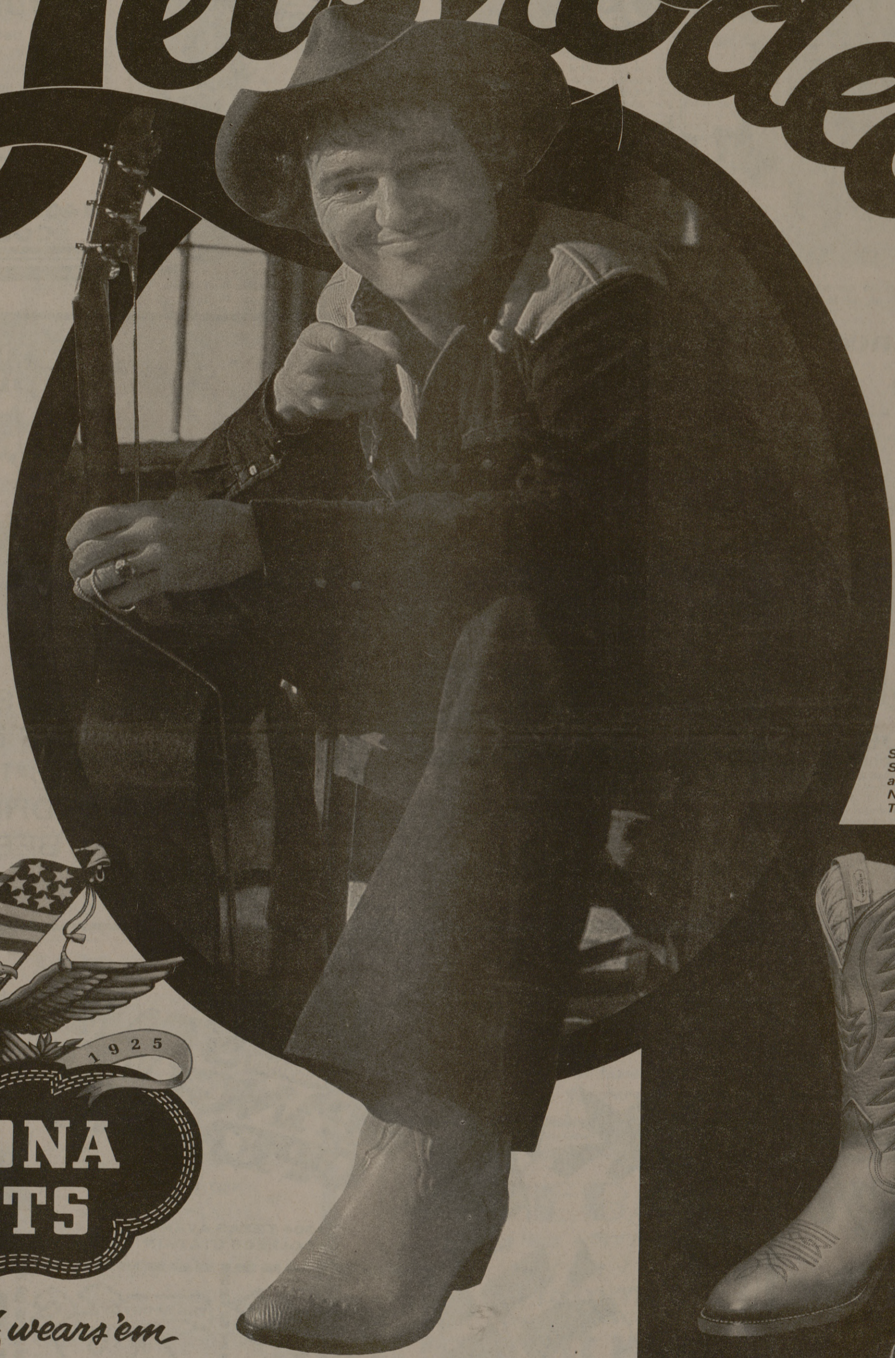
STYLE #5004. Sunrise Full-Grain Veal Vamp and 12" Top with deep scallop; No. 20 Toe; C Heel; Thin-Line Cushion Shank.