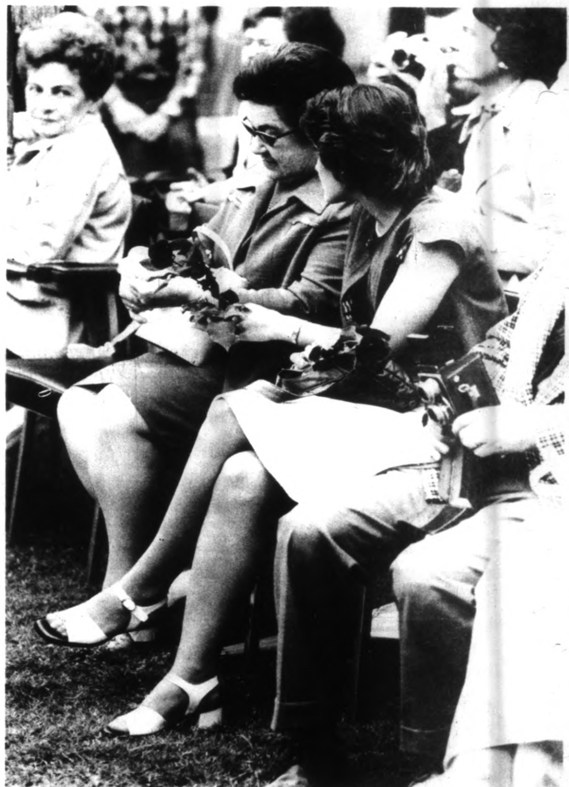
Proud mothers . . . and fathers attended the activities over the Easter weekend.

The entire family attends most campus activities, athletic events, Muster, all military reviews and other Corps functions.