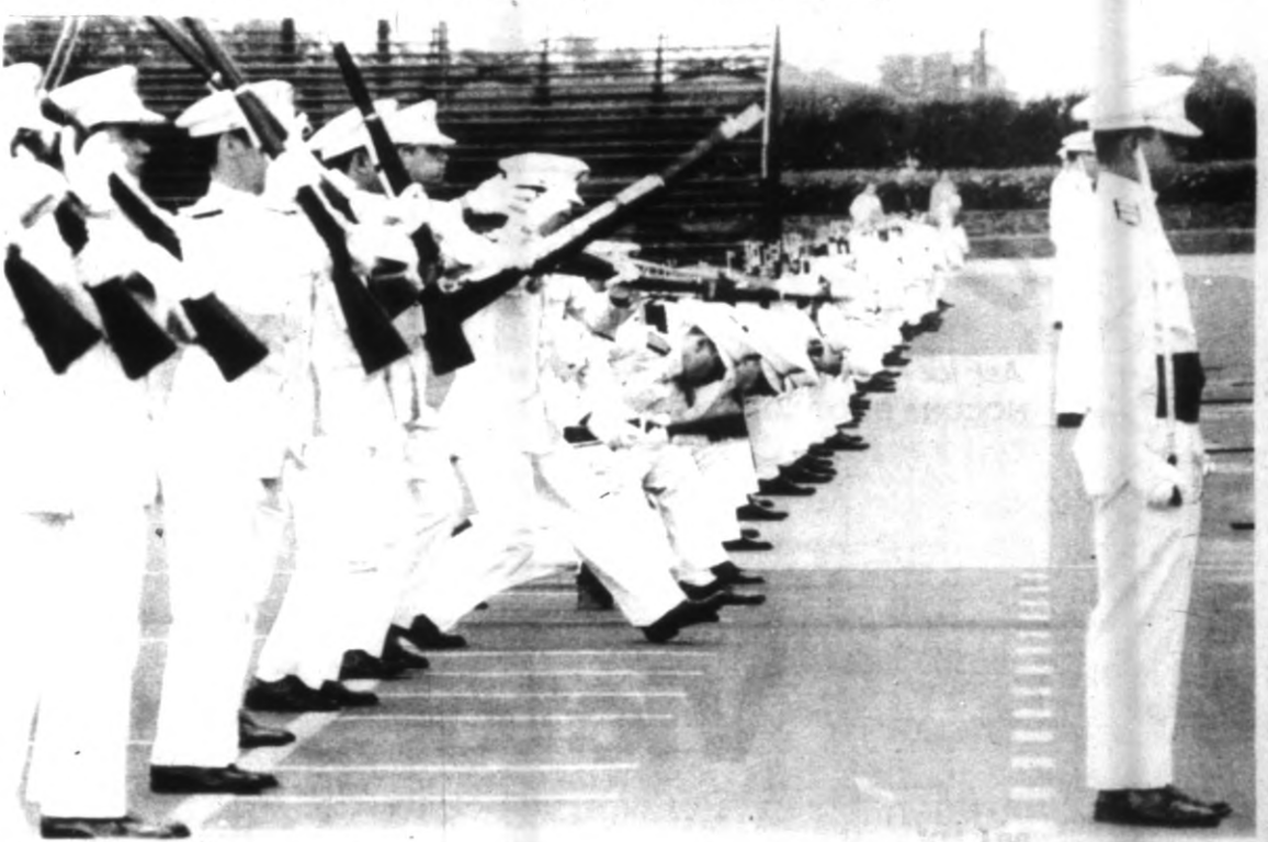
ROSS VOLUNTEERS . . . These junior and senior cadets perform a rifle ripple drill for parents on Kyle Field. The Ross Volunteer Company is Texas' oldest student organization and acts as the Governor's honor guard. These cadets live by the motto: "Soldier, Statesman, and Knightly Gentleman."