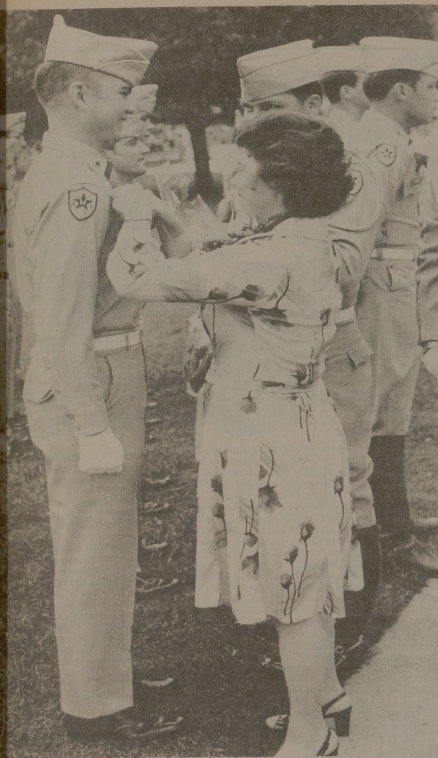
Dressed in style

This year's Muster was originally planned for the Administration lawn, but due to bad weather it will be held in the Coliseum.