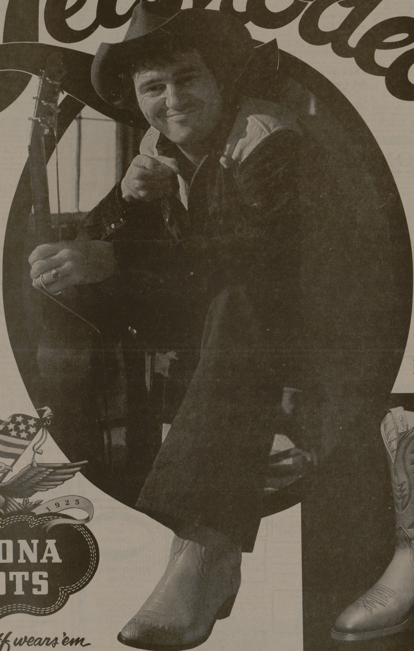
STYLE #5004. Sunrise Full-Grain Veal Vamp and 12" Top with deep scallop; No. 20 Toe; C Heel; Thin-Line Cushion Shank.