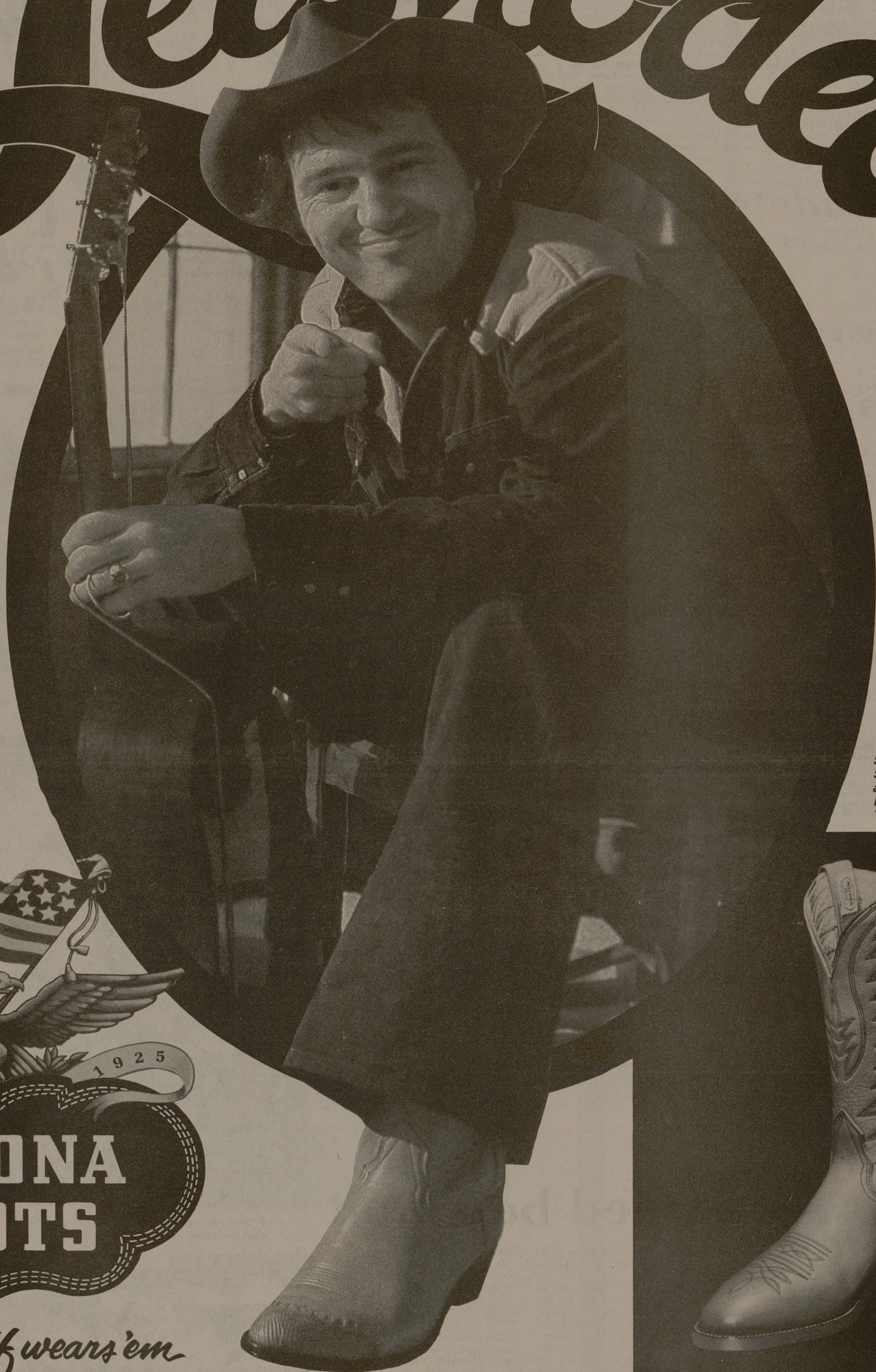
STYLE #5004. Sunrise Full-Grain Veal Vamp and 12" Top with deep scallop; No. 20 Toe; C Heel; Thin-Line Cushion Shank.