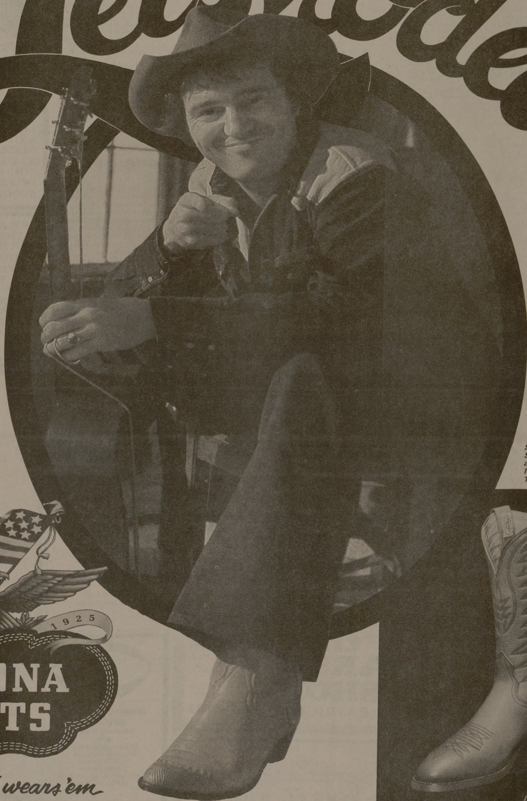
STYLE #5004. Sunrise Full-Grain Veal Vamp and 12" Top with deep scallop; No. 20 Toe; C Heel; Thin-Line Cushion Shank.