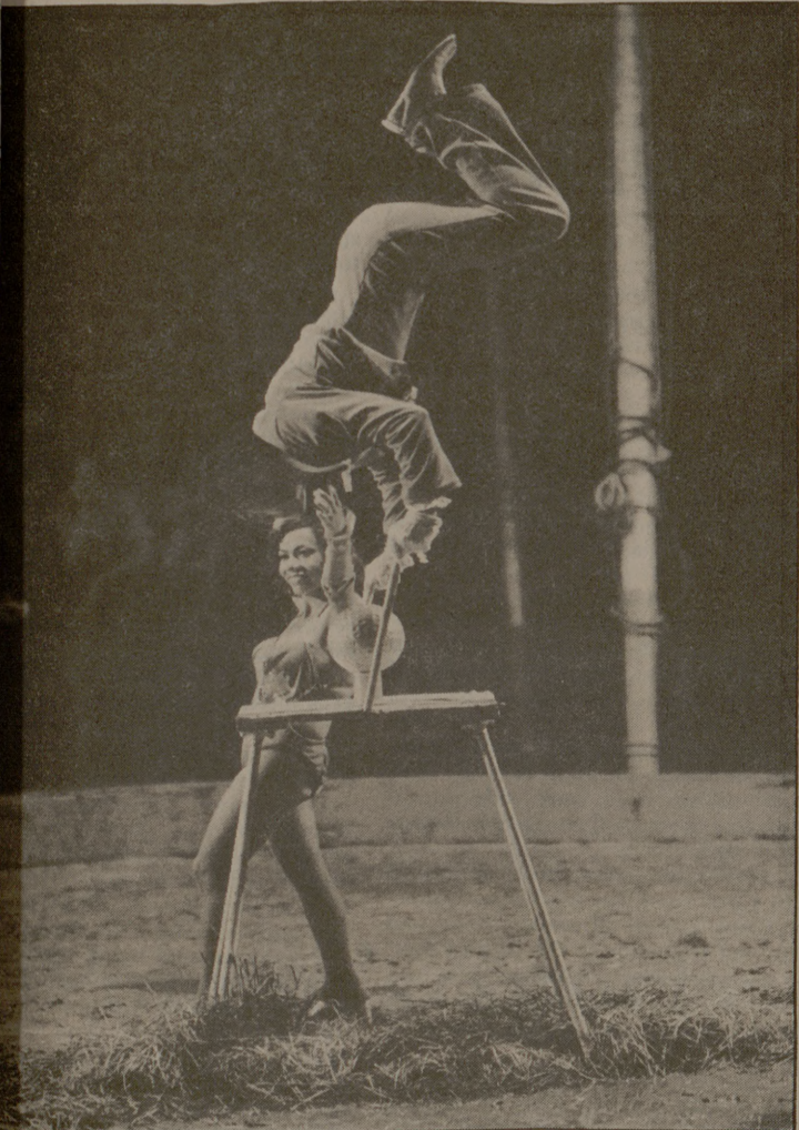
ACROBAT AND HELPER Acrobatics form a large part of the show

The circus. What is it? To the viewer it's a bright spangled parade, the quiet tension of a high wire act, small children laughing at the clowns.