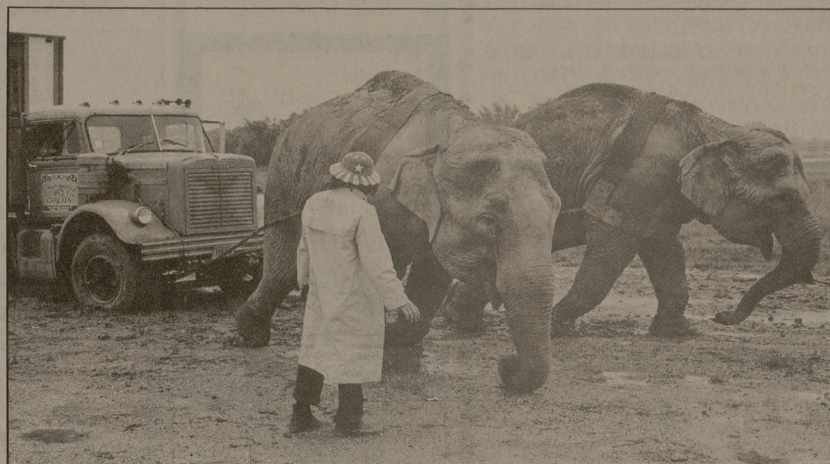
ELEPHANTS HAVE TO WORK Elephants pull the big trucks out of the mud