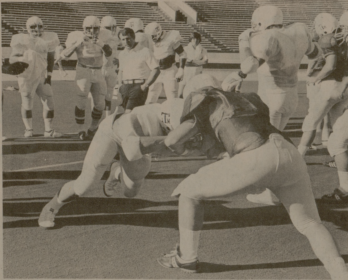
Head Coach Emory Bellard looks on as the Aggie gridders continue daily workouts at Kyle Field.

Today's prelims start at 9 a.m. with competition continuing until 9 p.m. Saturday's competition will stretch from 2 p.m. to 6 p.m.