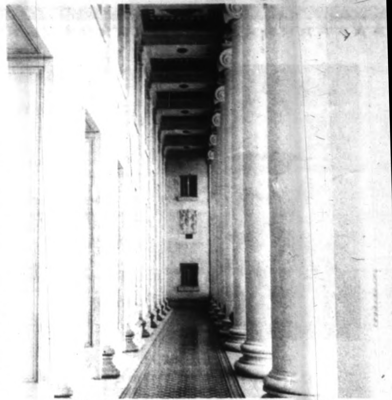
IONIC COLONNADE ON THE EAST FACE