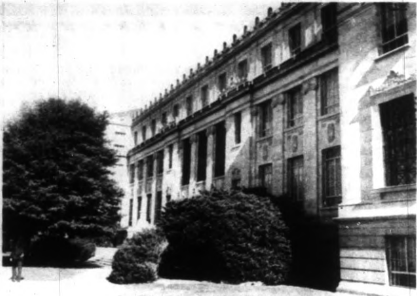
WEST FACE OF THE SYSTEMS ADMINISTRATION BUILDING