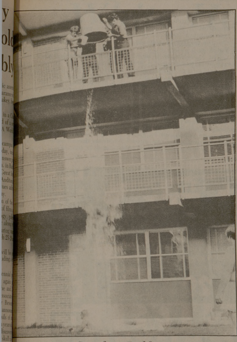
Care for a Bath?

The coming of spring has once again brought Aggies looking