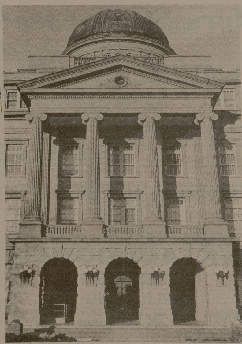
The west entrance is fronted by columns of neo-classical design.