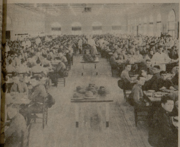
"The World's Largest Dining Room" as it appeared in 1920's.