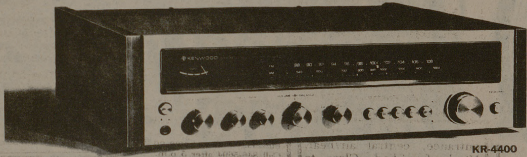
KENWOOD KR-4400 AM/FM-STEREO RECEIVER

KENWOOD sets the standards for stereo receivers, four-channel receivers, separate tuners and amplifiers, cassette decks, turntables and speakers in every price range.