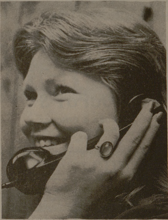
The stone is BRIGHT BLUE, she is happy and at ease.

The Mood Telling Extra Gift for Christmas