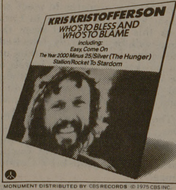
MONUMENT DISTRIBUTED BY CBS RECORDS © 1975 CBS INC.

Who said, "Broken rules are all the same"?