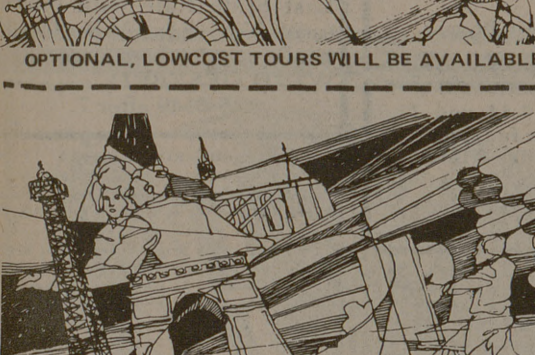
OPTIONAL, LOWCOST TOURS WILL BE AVAILABLE