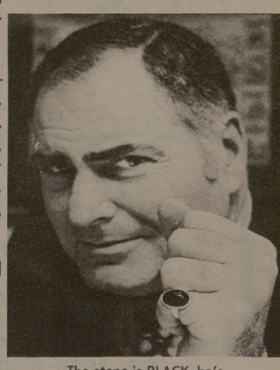
The stone is BLACK, he's

It's fun to watch and is quite a conversation piece. Gold or Silver settings in sizes for men and women. Do not expose to water or direct sunlight.