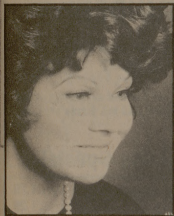
Marilyn Horne, Soprano

Rudder Center Auditorium 8:00 P.M. Thurs. Nov. 20