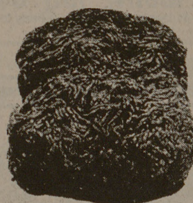
Extra Lean Ground Beef 99¢ lb.

Of course, for special occasions, dinner parties or just everyday deluxe eating you can still enjoy U.S.D.A. "Choice" Beef cuts also available at FedMart savings you'll like. Either way, when you shop for meat at FedMart you've got to come out ahead.