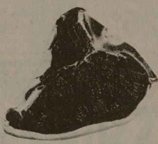
USDA Good Beef Loin T-Bone Steak $1 89 lb.