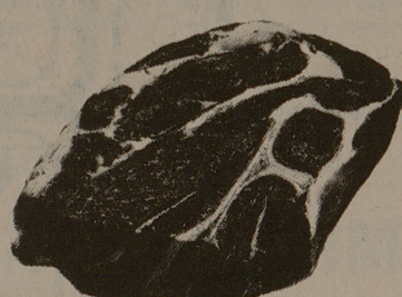
USDA Good Beef Chuck 7-Bone Roast 79¢ lb.