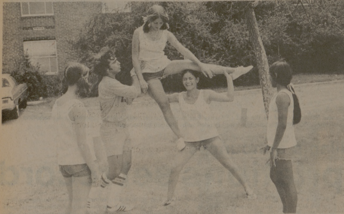
Cheerleaders, twirlers and drum majors have once again descended on the TAMU campus. The week long workshop which features high school students from across the state is designed to provide instruction in all aspects of cheerleading. As the picture above shows, some think it's funny, others not so funny.