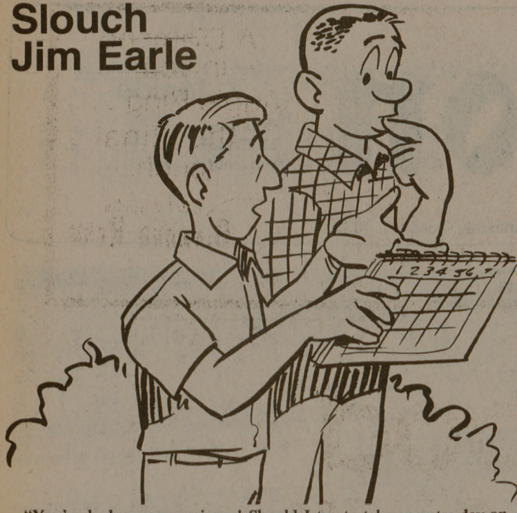
"You've had more experience! Should I try to take an extra day on Thursday before the fourth, or Monday after the fourth."