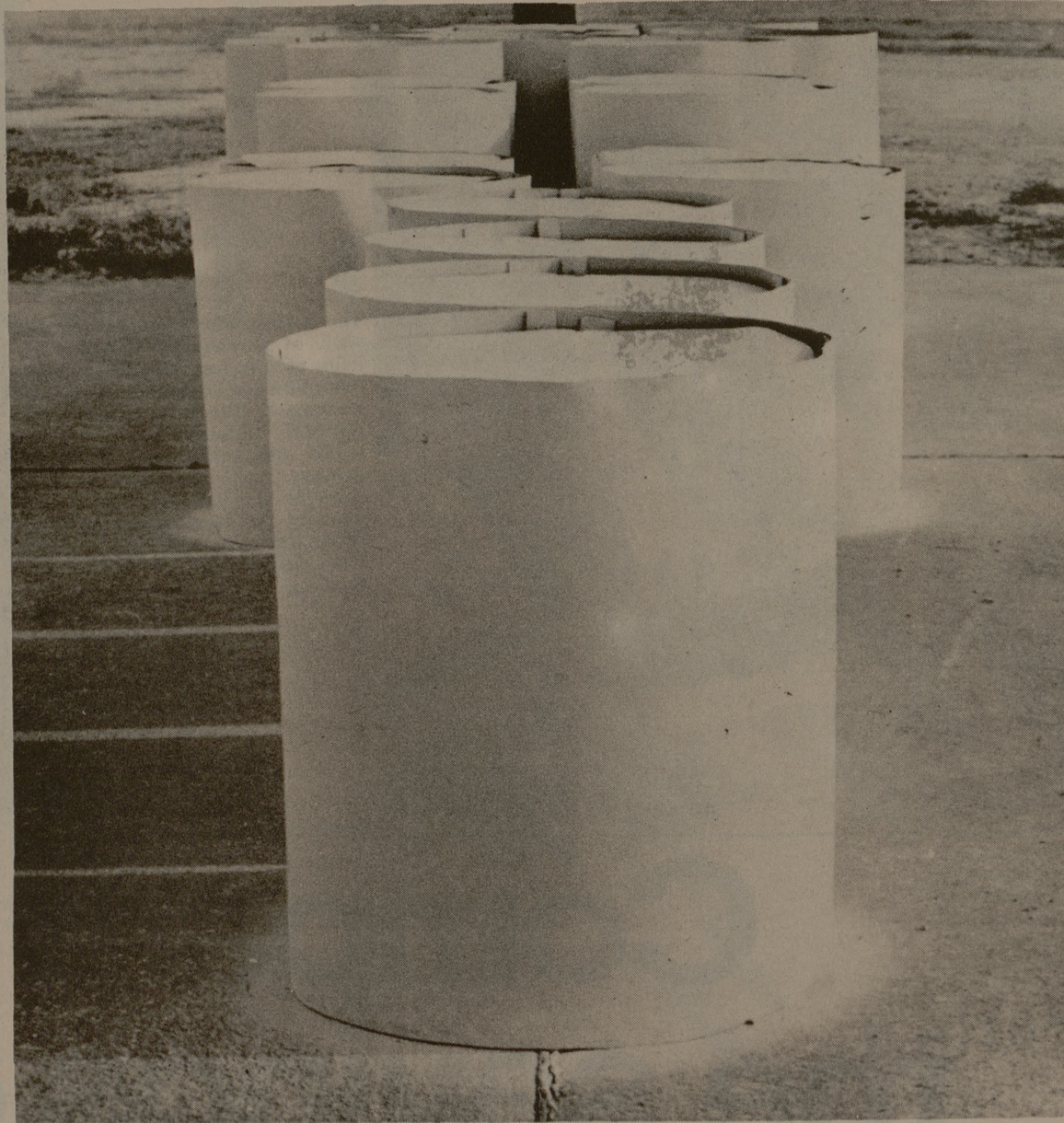
This row of barrels developed by the TAMU Texas Transportation Institute is actually tires filled with sand set on wire frames and covered with cardboard. They are placed in front of dangerous obstacles to protect errant motorists. They are cheap and reusable.