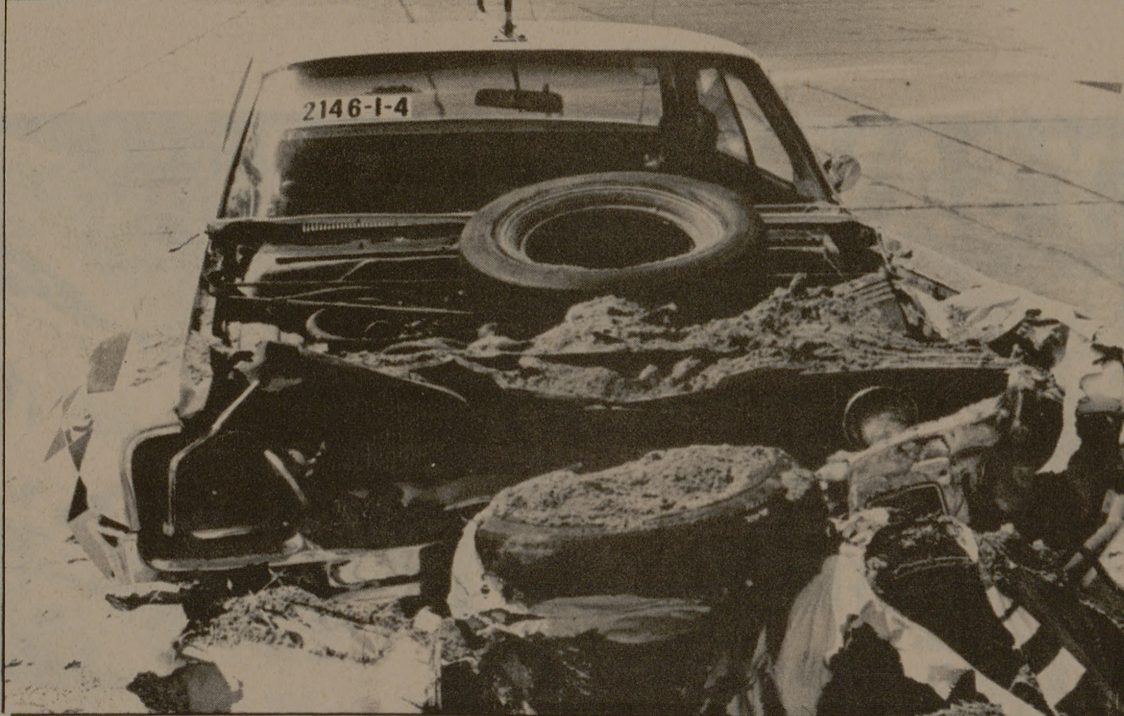
A tire and sand barrier developed at TAMU stopped this car traveling over 60 mph with only 6-G's force on the driver which he would have survived even without seatbelts. If it had been a normal cement barrier, the forces would have been 29-G's, sufficient to kill anyone in the auto.

CENTRAL CYCLE & SUPPLY Sales • Service • Accessories 3505 E. 29th St. — 822-2228 — Closed Monday Take East University to 29th St. (Tarrow Street)