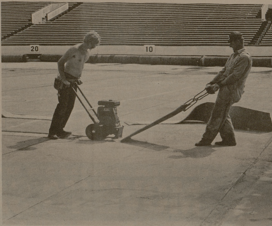
Using the latest thing in weight reducing equipment, two workmen remove the astroturf covering from the floor of Kyle field. The old turf which has seen four seasons of Fighting Texas Aggie football is being replaced so that next year's SWC champions will have better footing.

313 College Main Mon.-Sat. 10-6 846-5689