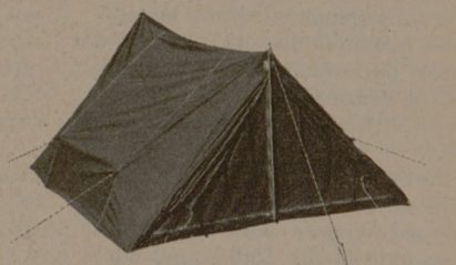
Stag Arctic Circle trail tent, made of polyester and cotton with waterproof floor.