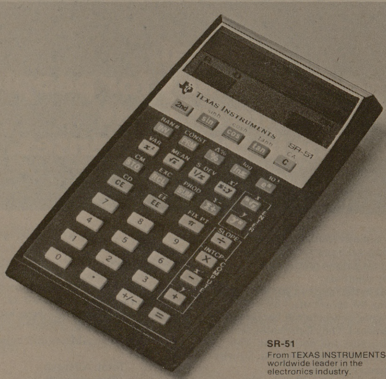
SR-51 From TEXAS INSTRUMENTS worldwide leader in the electronics industry.

No waiting for delivery. Your University Calculator Center has the largest inventory of quality units available anywhere. Plus, we specialize in the calculator requirements of the college student.