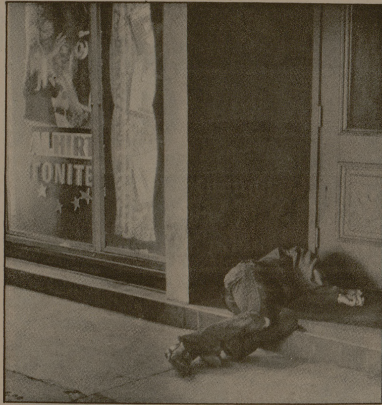
Alan Killingsworth A delegate didn't make it Bourbon Street tourist