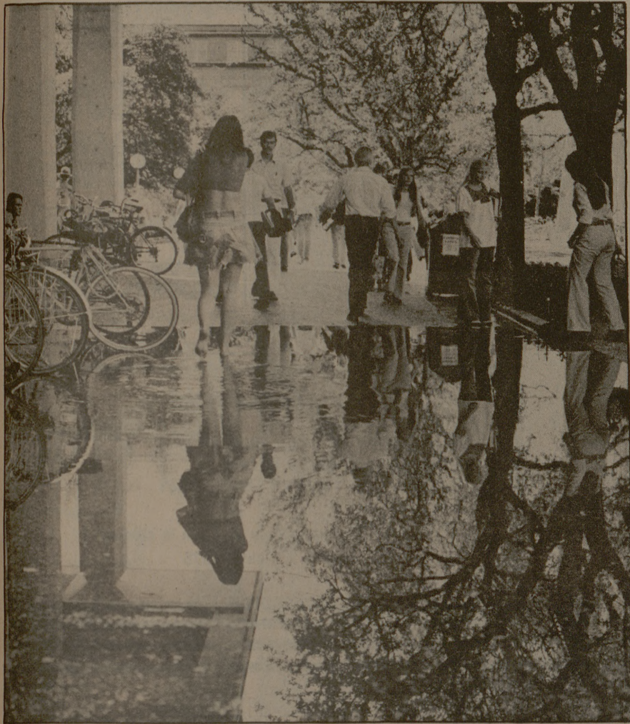
Douglas Winship 1st place feature photo