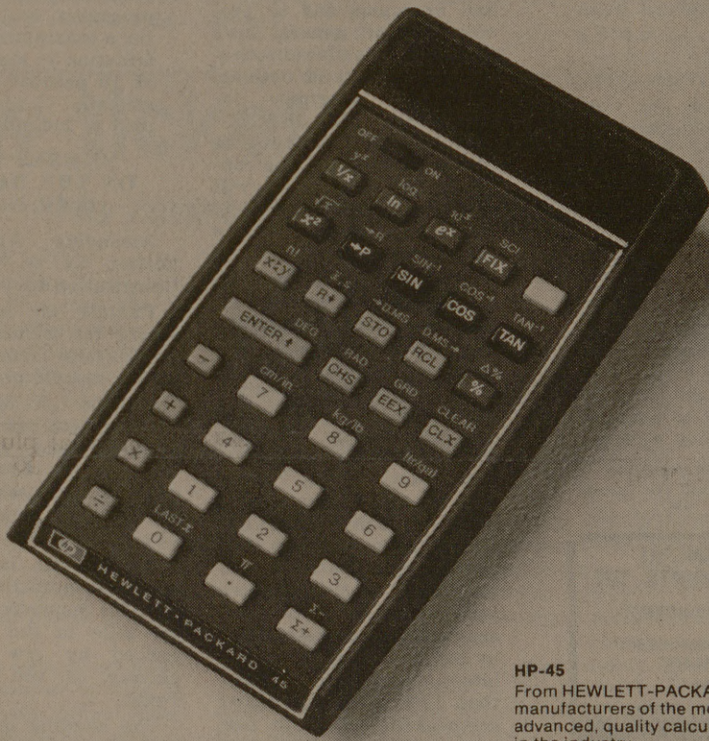
HP-45 From HEWLETT-PACKARD, manufacturers of the most advanced, quality calculators in the industry.

No waiting for delivery. Your University Calculator Center has the largest inventory of quality units available anywhere. Plus, we specialize in the calculator requirements of the college student.