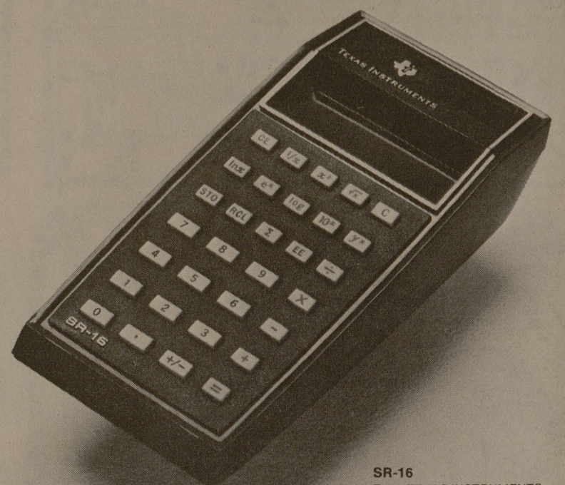
SR-16 From TEXAS INSTRUMENTS, worldwide leader in the electronics industry.

No waiting for delivery. Your University Calculator Center has the largest inventory of quality units available anywhere. Plus, we specialize in the calculator requirements of the college student.