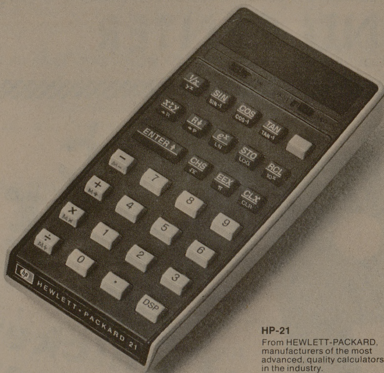
HP-21 From HEWLETT-PACKARD, manufacturers of the most advanced, quality calculators in the industry.

No waiting for delivery. Your University Calculator Center has the largest inventory of quality units available anywhere. Plus, we specialize in the calculator requirements of the college student.