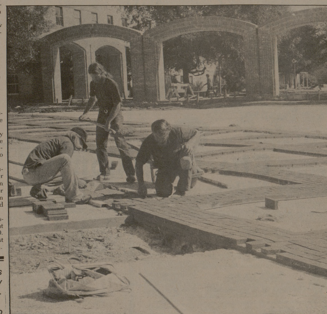
Tiles fall in place Renovation of Corps dorm area includes a sidewalk made of tiles. Workers are about to complete this part of the construction, and will go with arches and cement walks.